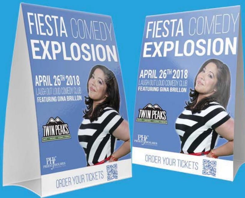
TABLE TENT SPONSOR